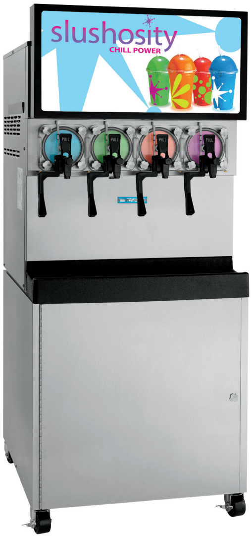
Shown with Slushosity ® Merchandising Materials Consult Taylor distributor for merchandising options.